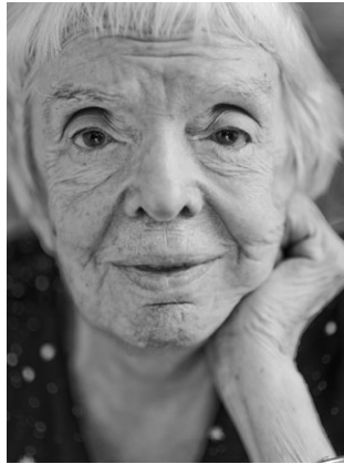
Lyudmila Alekseeva, Human rights activist