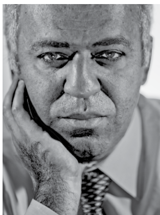
Garry Kasparov, World Chess Champion

The exhibition will be open through December 12, 2011.