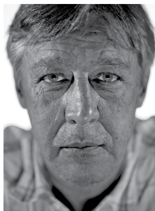
Mikhail Efremov, Actor