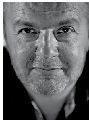
Victor Shenderovich, Satirist