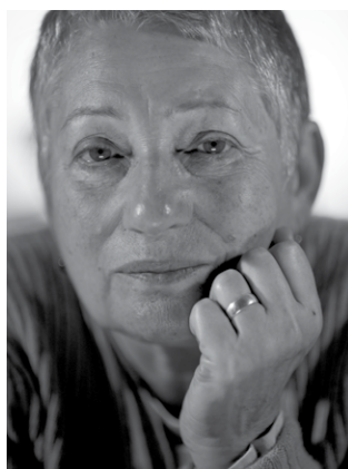
Lyudmila Ulitskaya, Writer