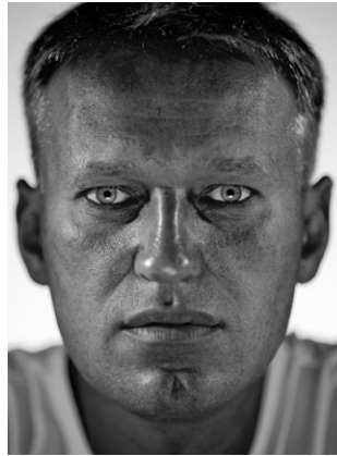
Alexey Navalny, Lawyer