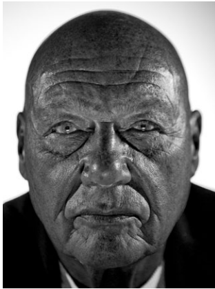
Vladimir Pozner, TV-host